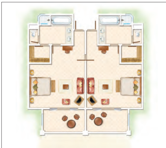
2-Bedroom Deluxe Family Apartment