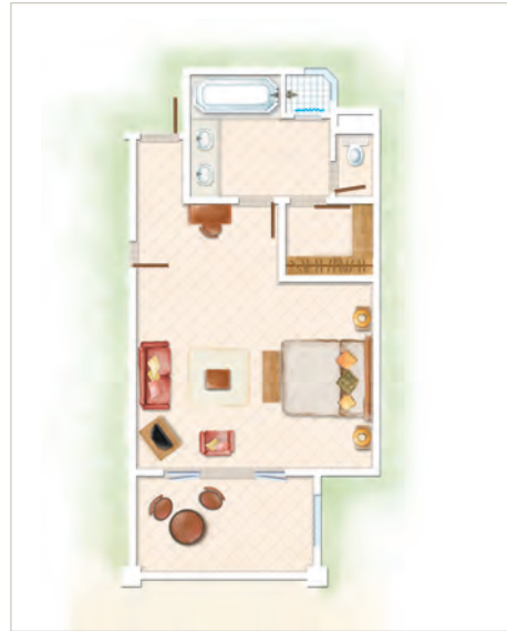
Deluxe Room / Deluxe Ground Floor