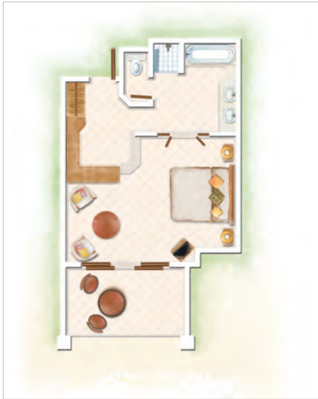
Superior Room / Superior Ground floor